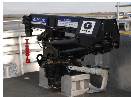
On Deck Crane