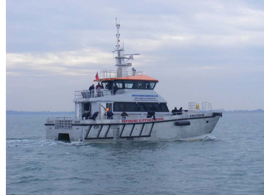
Double Height Wheelhouse

Aluminium Boatbuilding Co. Ltd. Mill Rythe Lane Hayling Island Hampshire PO11 0QG paul@abcsales.co.uk