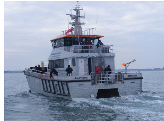
From the Stern