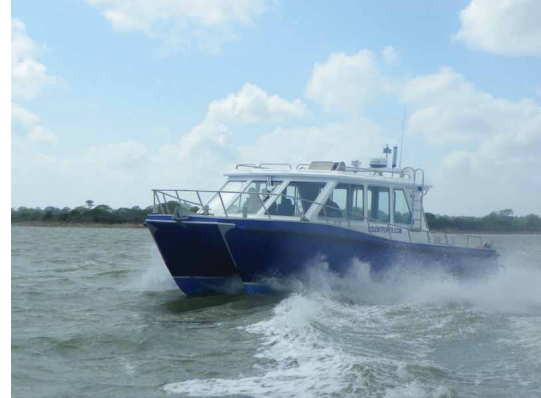
High Top Speed

Aluminium Boatbuilding Co. Ltd. Mill Rythe Lane Hayling Island Hampshire PO11 0QG paul@abcsales.co.uk